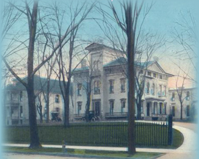
Homopathic Hospital, Rochester, NY, circa 1920

Monroe County Medical Society 7th District Branch of the Medical Society of the State of New York The Rochester Academy of Medicine